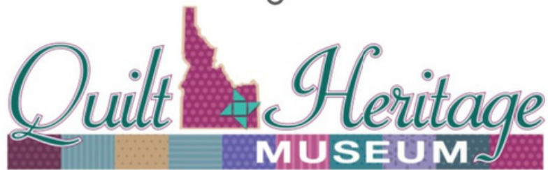
Exhibit Schedule Announcement