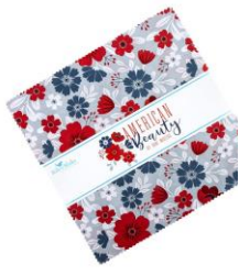
Layer Cake Pkg.