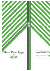
Clearly Perfect Angles