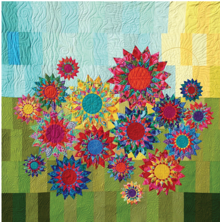
Example of Sunflower quilt made with fat robin ruler.